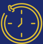
FLEXIBLE AND FAMILY FRIENDLY POLICIES