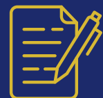
FREE WILL WRITING SERVICE

Staff can work across our family of schools, enabling our academies to benefit from wider expertise and to offer individuals fresh opportunities. Quality of life outside work significantly shapes the way in which people perform, so the need to achieve a healthy work/life balance is an important aspect of our commitment to staff.