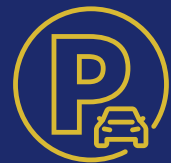
FREE PARKING ON SITE